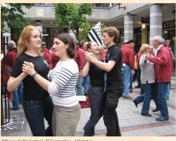
Kilkenny Celtic Festival, 25 September - 4 October

Contact: Margaret McGrath E magmcgrath@gmail.com w www.celticfestival.ie