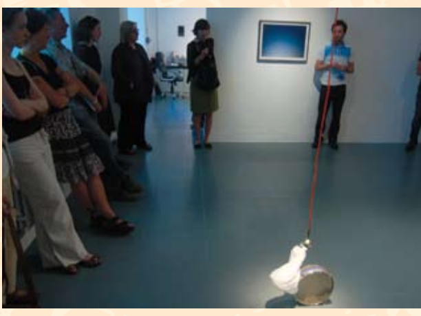
Lunch Time Talks, 14 & 28 October